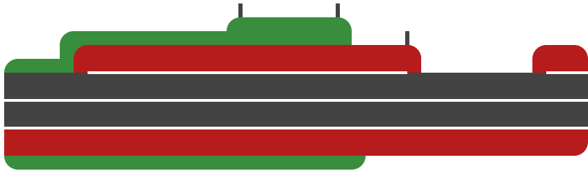
Prioritising for sustainable transport