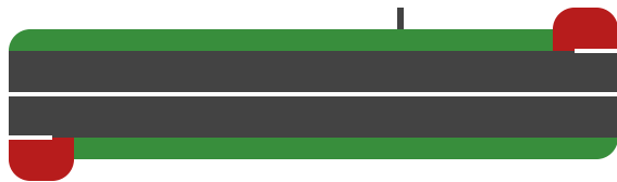
Prioritising for sustainable transport